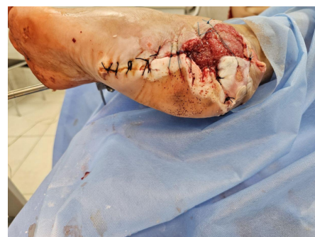
S/P Day 14: EZDebride Sharp Debridement: Retention Sutures