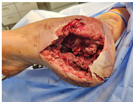
Negative Pressure Removed Status Post Day 7