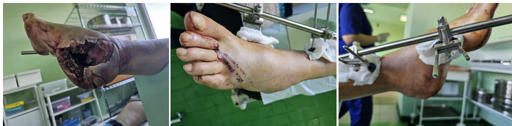
Status Post Day 4: dressing removal, EZDebride Sharp Debridement: Negative Pressure

Abstract: This is a presentation of a Ukraine Soldier who underwent limb salvage procedures including surgical debridement and external fixation secondary to a severe ballistic injury to his left lower extremity. The patient presented with a large wound of the lateral rearfoot, devitalized tissue, and comminuted fractures. Methods: The EZDebride Wound Instrument was utilized throughout the perioperative, post-operative, and multi-modal care treatment phases which included the use of negative pressure and a split thickness skin graft to determine its efficacy in a complex trauma and wound care presentation. Conclusion: The author found the EZDebride Wound Instrument to be extremely effective in the debridement of the devitalized tissue and wound bed preparation for advanced wound technologies including negative pressure and a split thickness skin graft application.