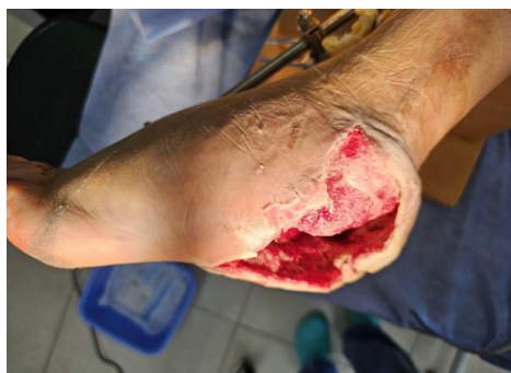
Wound Bed Preparation S/P Day 7: EZDebride Sharp Debridement